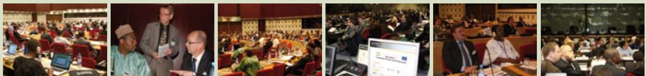
1st Euro-Africa Cooperation Forum on ICT Research (March 2009 - Brussels, Belgium) & 2nd Forum (February 2010 - Addis Ababa, Ethiopia)

M eeting the networking needs of the e-Infrastructures domain, the "2010 Euro-Africa e-Infrastructures Conference" aims at becoming a key place for main stakeholders in the field coming from all over Africa and Europe. The conference organising team is gearing up for a very first exciting event filled with discussions and debates, networking opportunities, and knowledge-sharing among all key stakeholders in the field and policymakers. This event - the first of its kind in the field - aims at standing out as the premier gathering place for all experts and stakeholders engaged (or interested) in the e-Infrastructures domain.